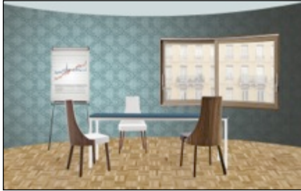
Figure 2 : Oval Room