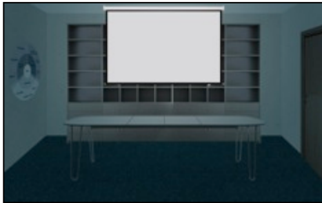
Figure 4 : Decision room