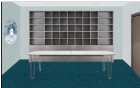
Figure 3 : Situation room